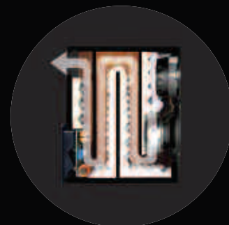
DB1i - Showing ATL™