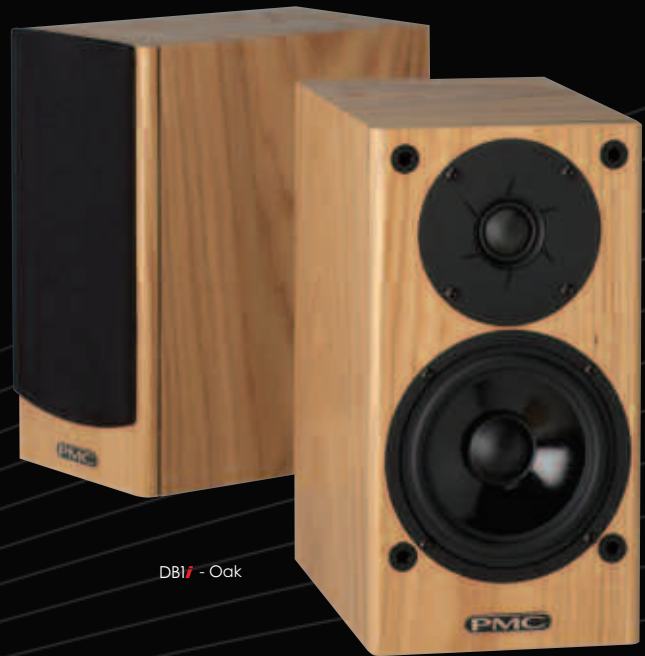
DB1i - Oak

The DB1 i is the definitive compact monitor and has a celebrated history with accolades of 'loudspeaker of the year' and swathes of five star reviews from all corners of the world from both hifi & professional press. With the latest i series upgrades the DB1 i , pushes the boundaries of what can be achieved from a small monitor. No other compact has the ability to stun the listener with such deep controlled bass, huge soundstaging and dynamics, which would normally be the preserve of a speaker twice its size.