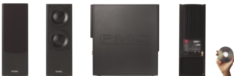
TLE1S (Professional Black Finish)